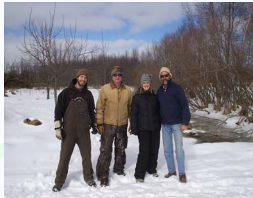
Winter creek walk along the Ulao Creek.

This spring the partnership will also be hosting a garlic mustard pull work day on May 21 st near the banks of the Ulao Creek. This will be a