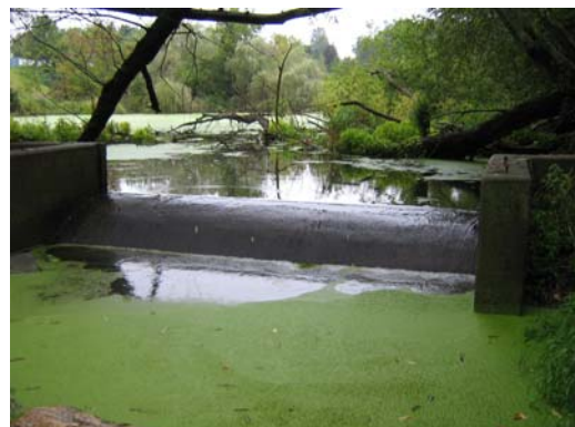
A Low-Head Dam Fragmenting Aquatic Habitats in an Ozaukee County Creek